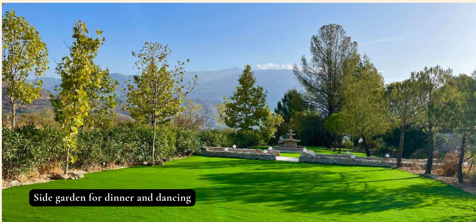
Side garden for dinner and dancing