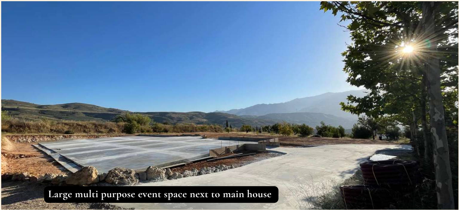
Large multi purpose event space next to main house