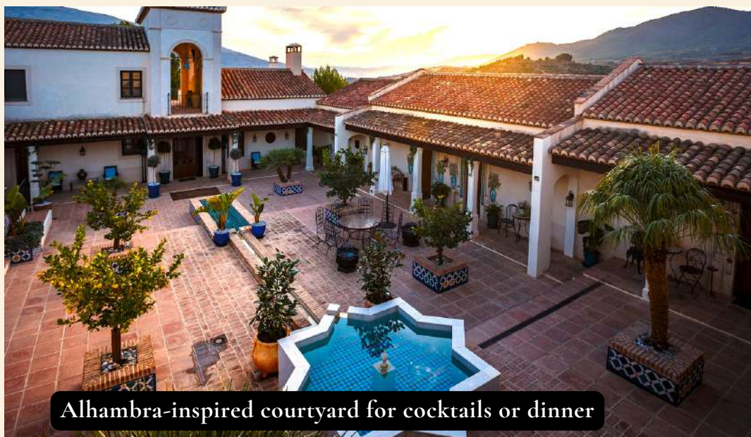
Alhambra-inspired courtyard for cocktails or dinner