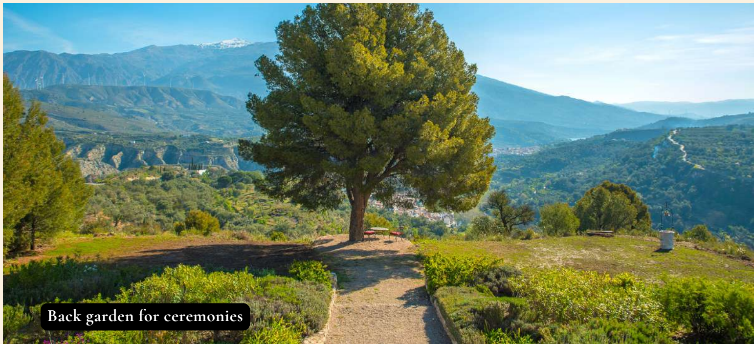
Back garden for ceremonies