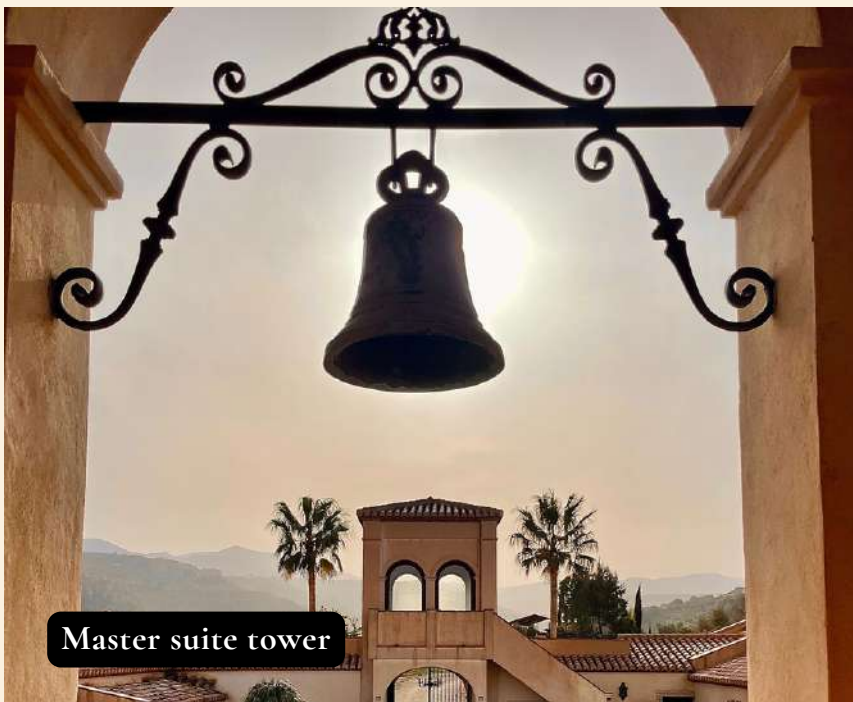
Master suite tower