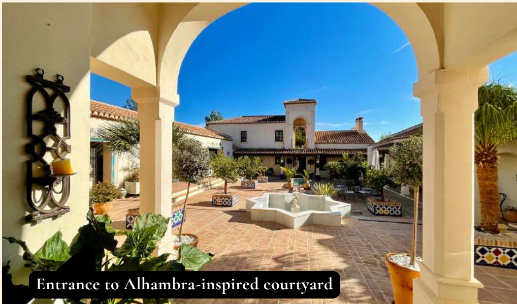
Entrance to Alhambra-inspired courtyard